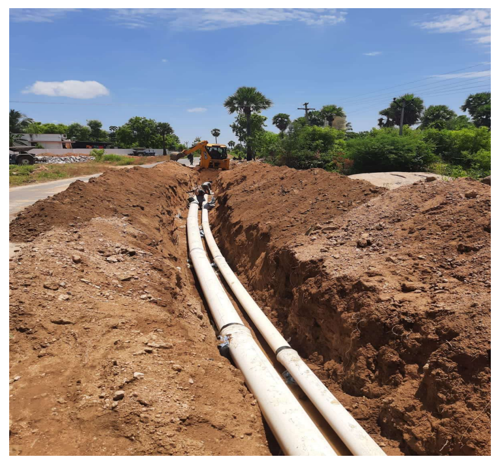
LIFT IRRIGATION PROJECT, NAMAKKAL